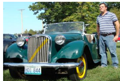
Singer Bantam Roadster all shined up for the show

Wow, what a car show! If you were able to make it, you experienced perfect weather, a perfect car field, perfect setup and execution, perfect food... it was all, well, perfect! With just over 160 cars, it had to be the largest I've attended.