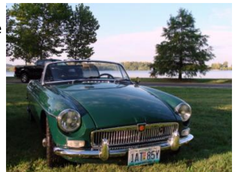
My '63 thru '65 MGB. Runs great, looks great, a blast to drive, definitely not concours.

articles about what they are doing with their cars. Describe their favorite routes, tell us where the cool destinations are, and give us some of their best drive stories. After all, what is great about this club is we don't just build great show cars, we really drive them. Then there are interest articles about the history and bemusement of owing our LBC's. These are fun to read and really round out the content. I am lucky to have a couple of those stashed away for lean times. I hope everyone will continue contributing to and enjoying The St. Louis Metro Gazette as much as I'll enjoy editing it. Thanks for my turn at the desk!